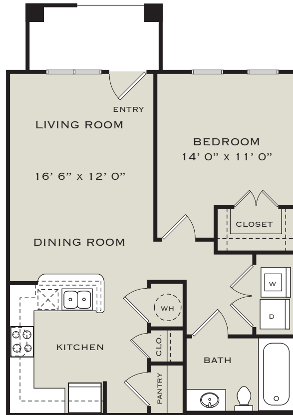
THE ASHLAND (A2) ONE BEDROOM/ONE BATH FLAT 685 SQUARE FEET

ALL SQUARE FOOTAGES AND ROOM DIMENSIONS ARE APPROXIMATE.