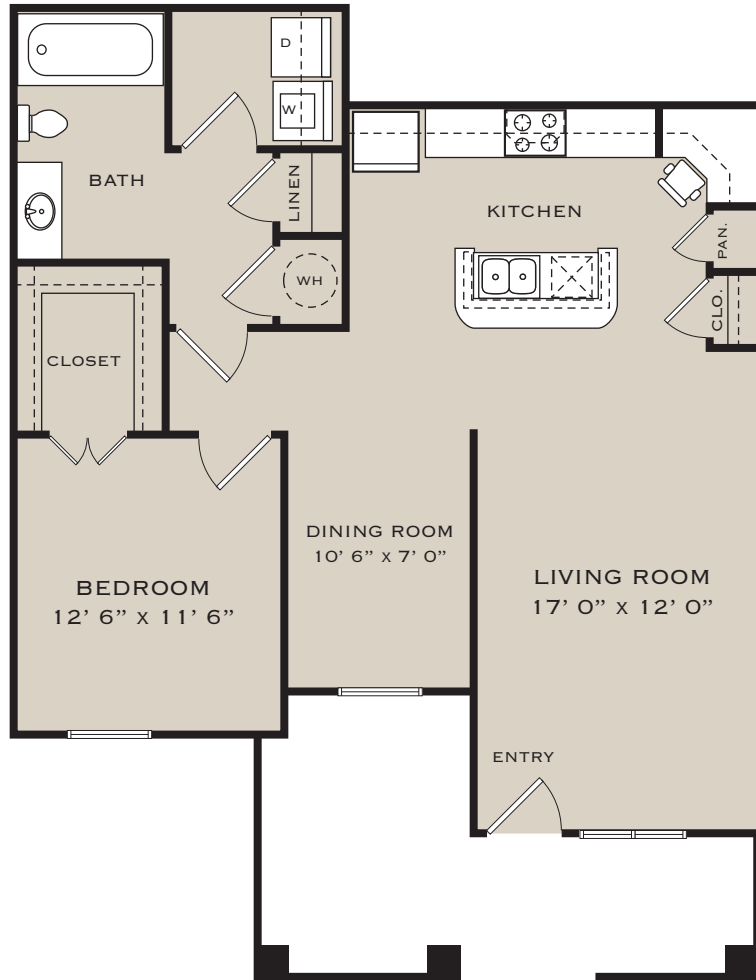
THE RIVOLI (A3) ONE BEDROOM/ONE BATH FLAT 1,074 SQUARE FEET

ALL SQUARE FOOTAGES AND ROOM DIMENSIONS ARE APPROXIMATE.